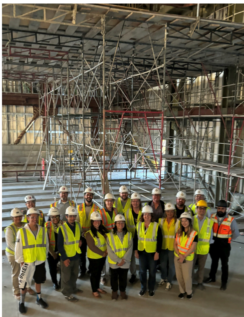
Photo: Employees tour new PAC.

This visionary project meets the College's goal of a modern performing arts venue and serves as a model for sustainable construction in educational facilities nationwide.