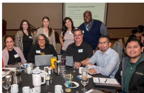
Photo: Student Services Representatives.

On May 9, Crafton Hills College representatives from the Student Services team participated in the Growing Inland Achievement (GIA) Equity Summit, immersing themselves in reviewing and revising campus policies through an equity lens.