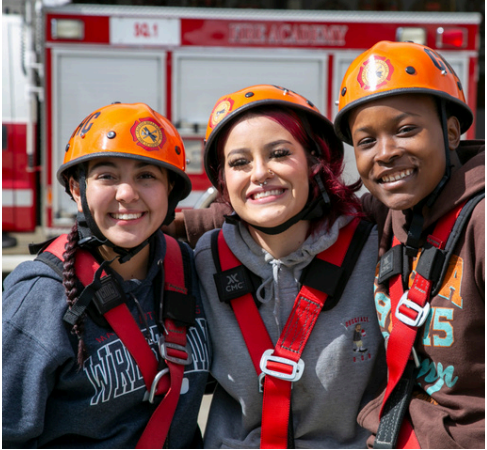
Attendees at the empowerment camp.

firefighters serving as mentors and role models. One participant shared, "This camp changed my perspective so positively! I now trust that with time, effort, and passion, I can achieve my goals in the fire industry." The camp's success has led to plans for it to be an annual event, further inspiring young women to pursue careers in the fire service.