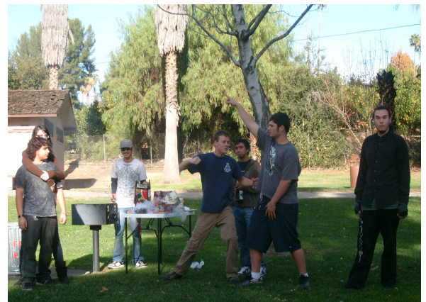
AMC poses for a picture at one of their club socials

As stated, "We are the next generation of artists. We are the Anime/Manga Club."