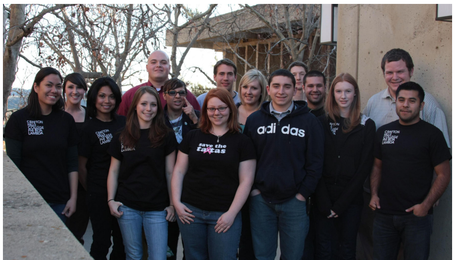
PBL members strike a pose after their weekly meeting.