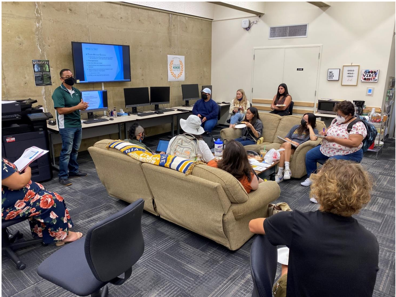
A picture from the Pizza in the Lounge/ Tag Workshop Event on September 15.