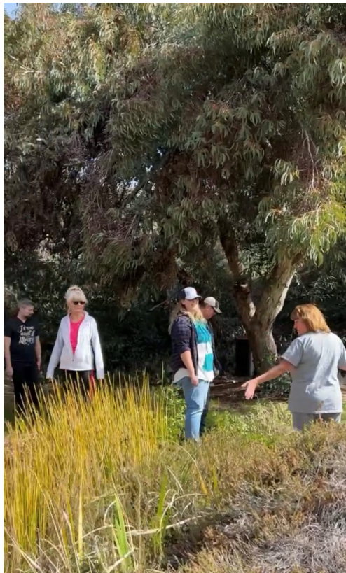
Photo: Sociology class discovering campus.