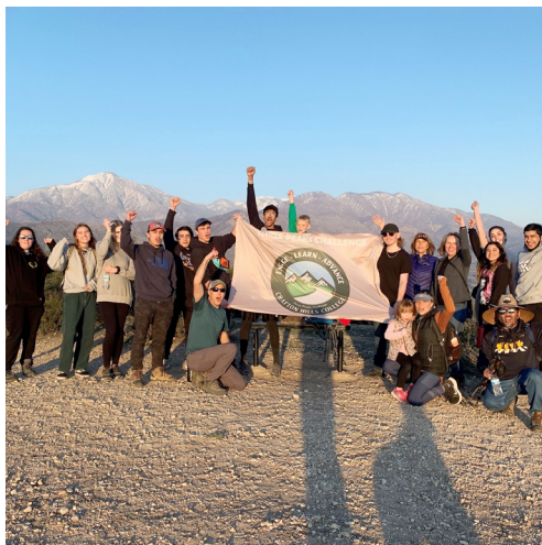
Photo: CHC hikers at the top of Zanja Peak.