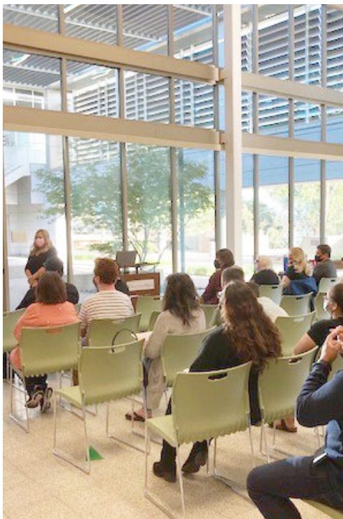
Photo: Parents and future students at College night.