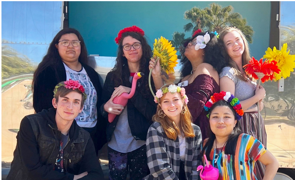
Photo: CHC students pose for photo.