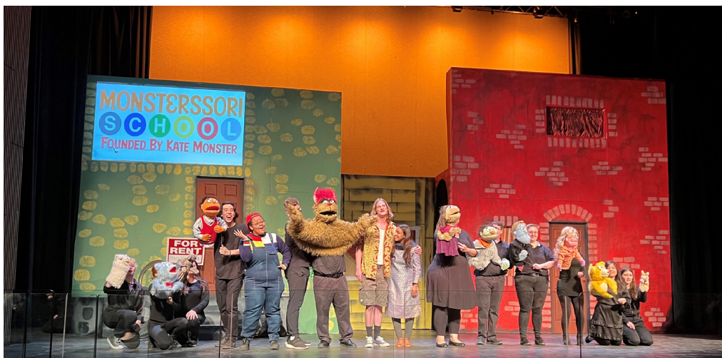
Photo: Ave Q cast on-stage opening night.

To learn more about clubs available at Crafton, or how to charter a club, visit www.craftonhills.edu/studentlife .