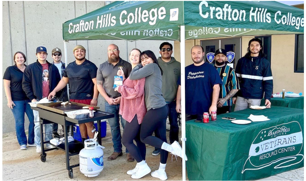
Photo: CHC Veterans Resource Center staff and students.

And finally, on November 15, the CHC Veterans Resource Center and the Student Veterans of America (SVA) chapter hosted a BBQ lunch for student veterans that featured giveaways, music, and games.