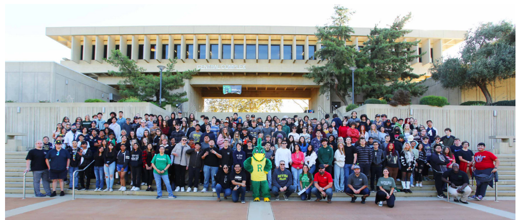
Photo: Yucaipa high school students visit Crafton Hills College.

Over 250 seniors from Yucaipa High School swarmed the campus on Oct 28 for our first ever YHS meets CHC Preview Day. The students had the opportunity to learn about what Crafton has to offer. They toured the campus, learned about financial aid options, the EMS programs and met with current students. It wasn’t all workshops though. Ryker the Roadrunner was also in attendance to hand out t-shirts and dance with the YHS seniors.