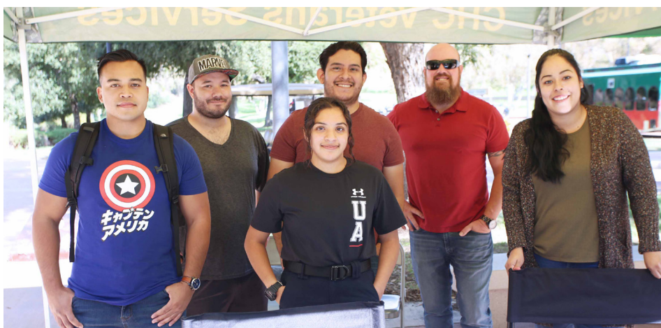
Photo: CHC Veterans Club at Club Rush.