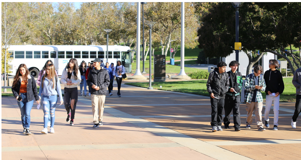
Photo: Rialto Unified School District high school students visit CHC.