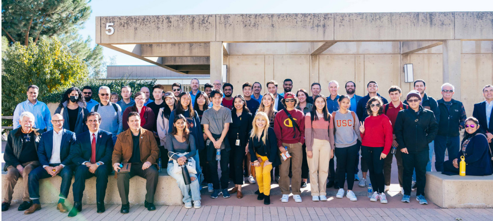
Photo: Attendees pose for picture before campus tour.

On November 15, Crafton Hills College hosted a presentation and campus tour for USC students studying construction management, architecture and design, state leaders in green building, and architects working on current projects within the district. The tour was focused on showcasing working examples of state-of-the-art sustainable facilities at the college.