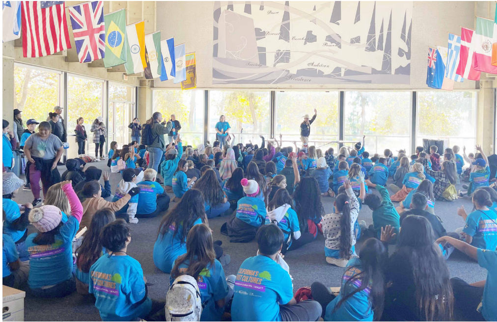
Photo: Fourth and fifth grade students at Waa't event.

The Crafton Hills area of Yucaipa is known as Waa't in the Serrano Indian Language, which, according to tribal elders, means juniper or where the juniper trees grow.