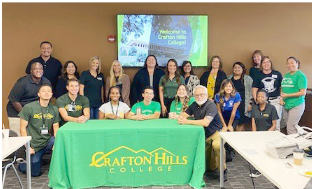
Photo: Local Counselors at CHC Counselor Outreach.

A total of twelve counselors attended, representing Citrus Valley High School, Beaumont High School, Oak View High School, Green Valley High School, Redlands High School, Redlands eAcademy and Redlands Independent Student Education (RISE).