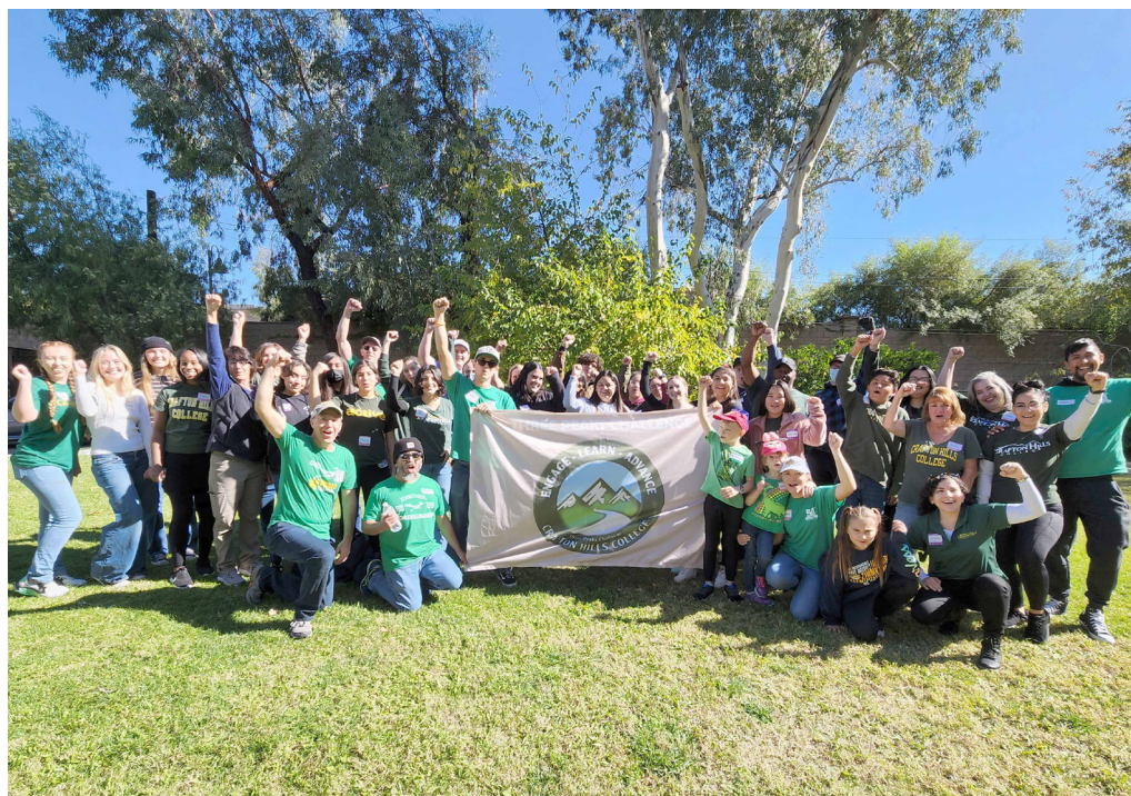
Photo: Crafton students and employees at Redlands Family Service Association.

Their participation was a Three Peaks Challenge event, designed as opportunities for CHC students to engage, learn, and advance. These events include physical stamina activities such as mountain hikes and service engagement opportunities, such as helping the Redlands Family Service Association.