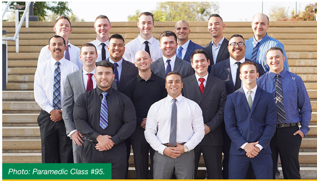
Photo: Paramedic Class #95.