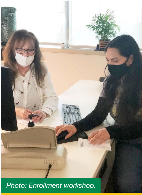
Photo: Enrollment workshop.