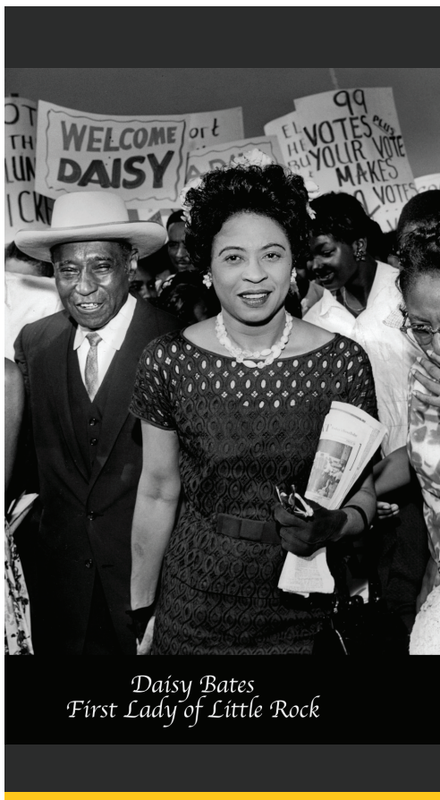
Daisy Bates First Lady of Little Rock