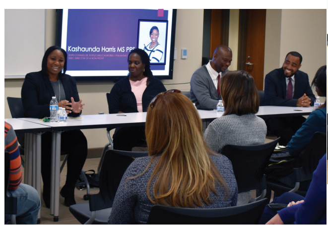
2/26: African American faculty and staff from Crafton served on a career panel.