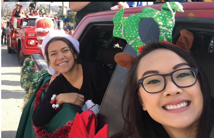
Student Senate rocked the Yucaipa Christmas Parade, representing Crafton Hills College.

The Counseling Department treated their student assistants to breakfast and photos as a semester-end thank you.