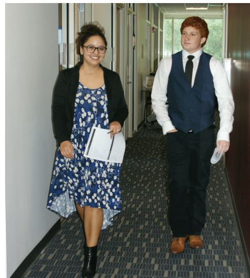
The Fall 2016 class prepares for their mock interviews.