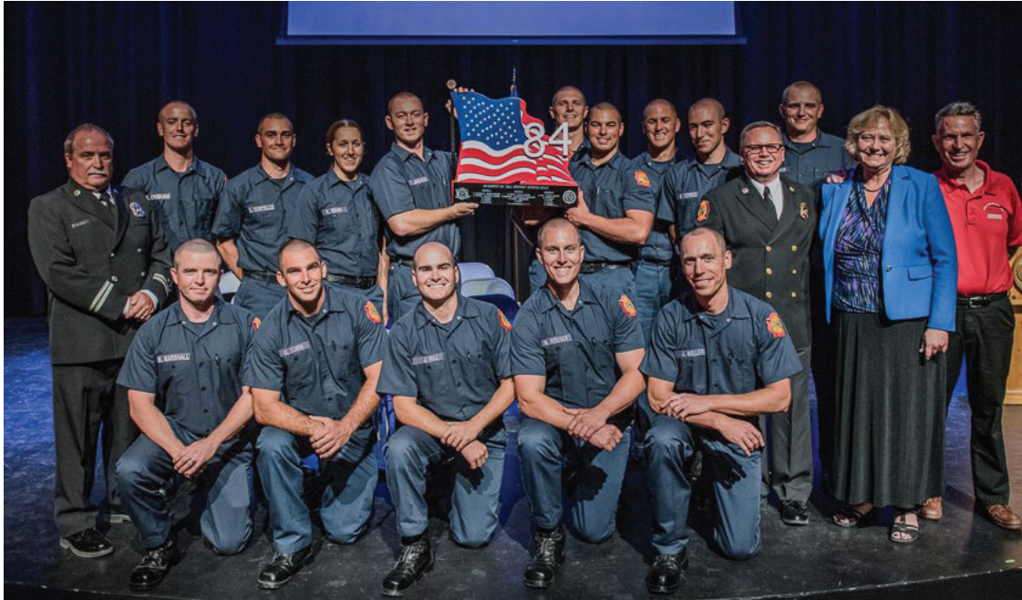
Fourteen cadets from throughout the Inland Empire graduated from the 84th Fire Academy on Wednesday, May 4 in the Performing Arts Center. Representing weeks of focused work and physical training, the cadets are now eligible for Firefighter I Certification.