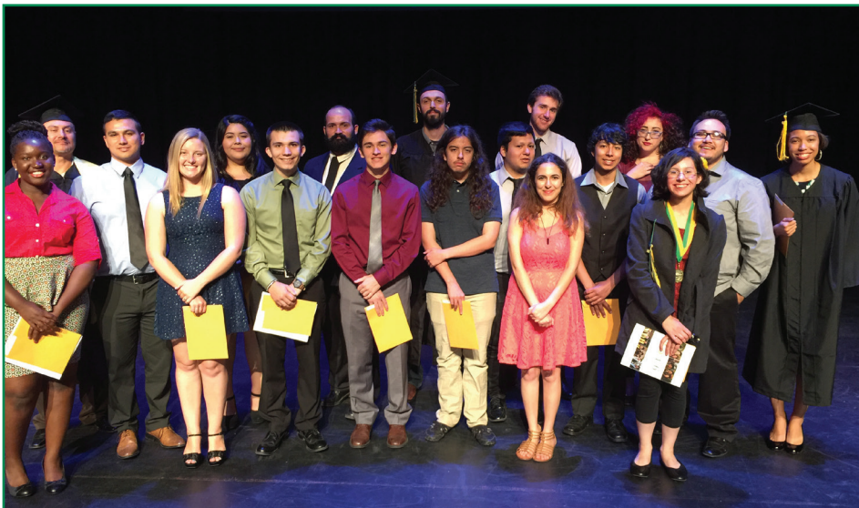
STEM Scholarship Recipients

Before the ceremony, donors to the CHC Foundation were invited to a reception to be thanked for their commitment to our students.