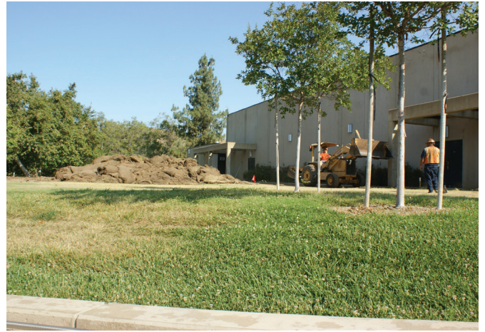
Gym Temp Modulares--Grading for placement of modulares