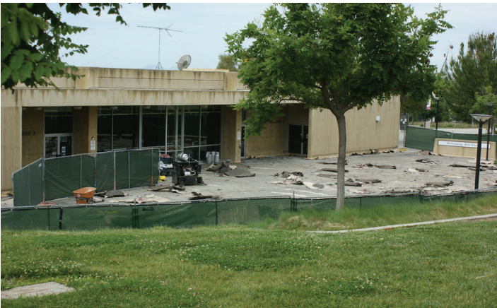
PAC Patio/Roof Replacement Project