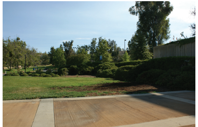
Quad Eucalyptus Tree Removal- Completed