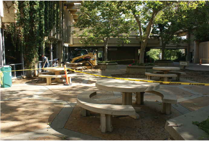
Cafeteria Plaza Improvement Project