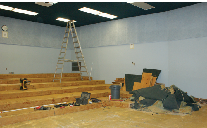
PAC 309 Improvement Project