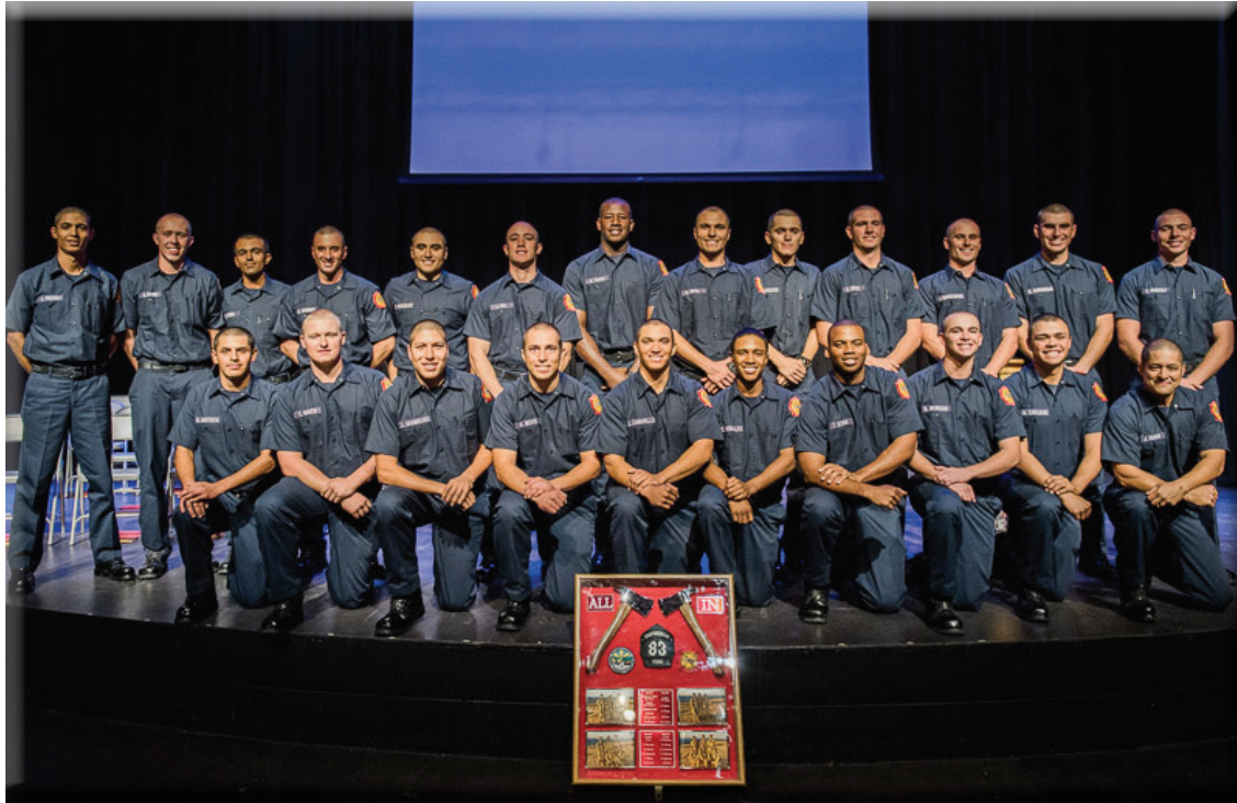
83rd Fire Academy Class

Crafton graduated its 83rd Fire Academy Class on Wednesday, November 18, at 6 p.m. in the Performing Arts Center.