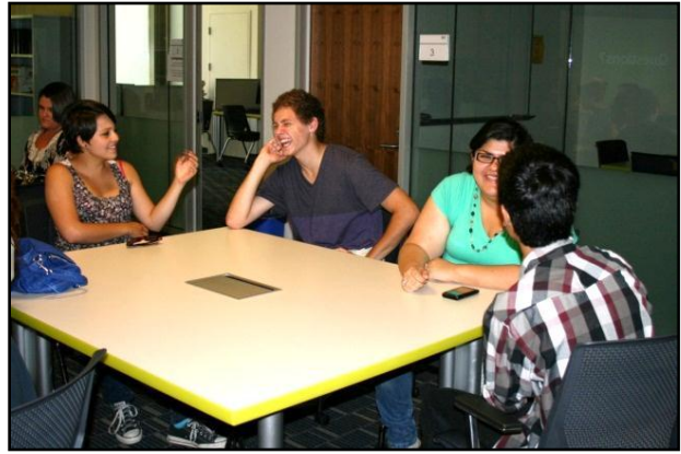
LLP students getting to know each other.

Learning Communities initiative and shows students the steps they need to take to succeed at Crafton. The reaction from students has been very enthusiastic. To date, we have received over 500 applications for the program and over half of these students have already participated in our “First Steps” meeting in which students were oriented to the program. Over the course of the next two weeks, LLP students will participate in the Kick-Off event where they will work with counselors to register for their fall class including all of their developmental math and English classes. After enrolling in classes, all LLP students will participate in the Summer Bridge program during the last two weeks of July to help ensure they prepared for their first day in college. While the pilot program will only be able to accommodate 300 students, we anticipate that the program will expand in accordance with its success.