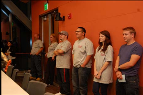
Health Sciences Club members help at the event