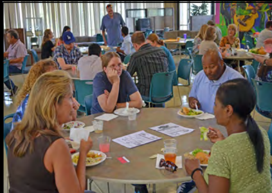
Above left: enjoying breakfast; Above right: enjoying lunch