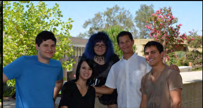
Above left and right: Students finding their way to classes on the first day of school