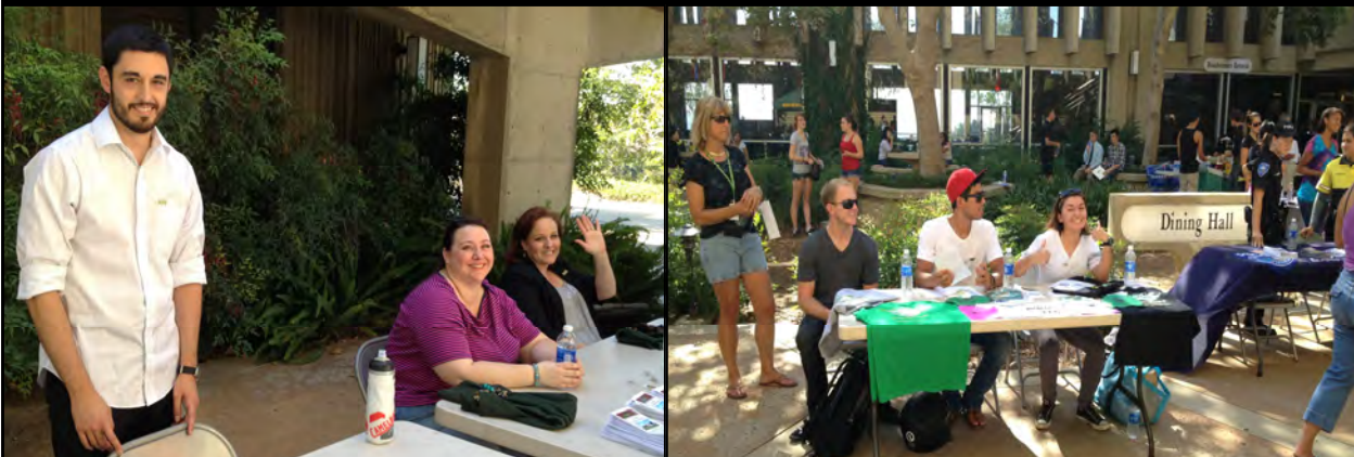
Above left, Tutoring Center staff available to answer questions. Above right, Crafton students recruit for Swim Club