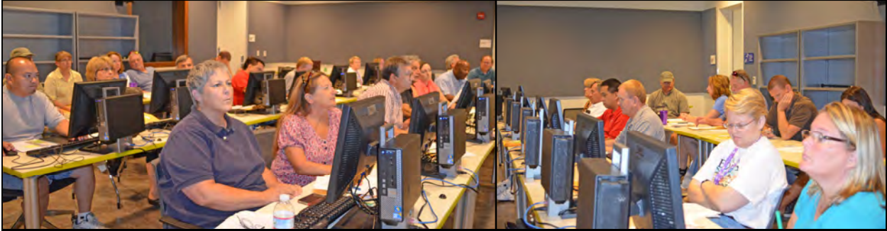
Above left and right: Faculty workshop on Student Learning Outcomes