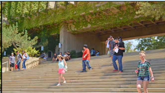
Above left and right: Welcome back, CHC Students!