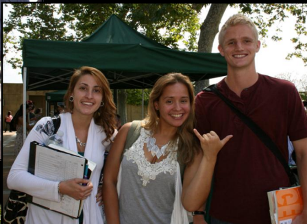
Above: Student signs "I love you"