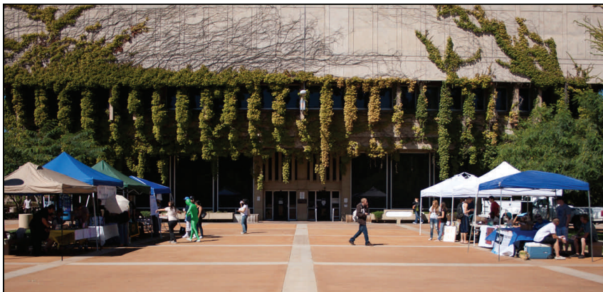
Left to Right: Anime Club, Terrestrial Investigations Club, Book Club

Lots of clubs participated in Club Rush!