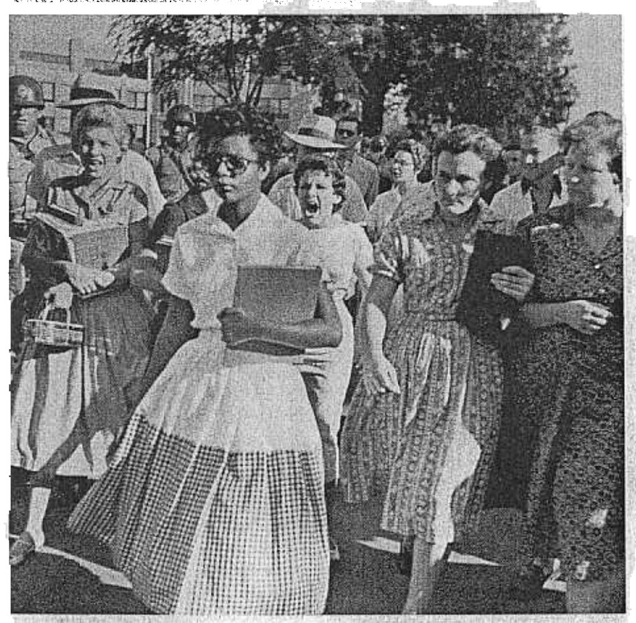
Brown radicalized Southern politics, spurring the rise of hard-line white supremacists.

STATE OF THE STATE OF THE STATE OF n May 17, 1954, the Supreme Court announced its decision in the case of Brown v. Board of Education. "Separate educational facilities are inherently unequal," the Court ruled unanimously, declaring that they violated the equal-protection clause of the Fourteenth Amendment. It thus overturned the doctrine of "separate but equal," which had been the law of the land since 1896, when Plessy v. Ferguson was decided. The Brown ruling—the culmination of a decades-long effort by the N.A.A.C.P. has today acquired an aura of inevitability. But it didn't seem inevitable at the time. And the fact that it was unanimous was little short of miraculous.