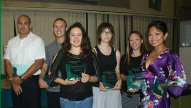
Students from various disciplines celebrate their scholarships.