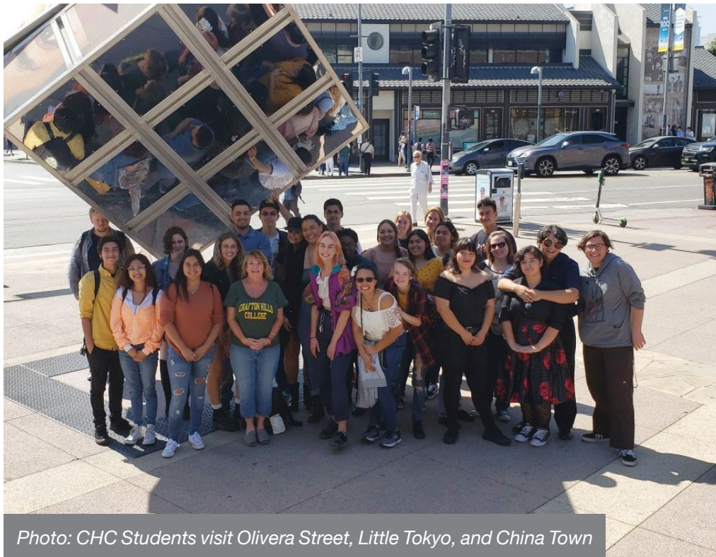
Photo: CHC Students visit Olivera Street, Little Tokyo, and China Town