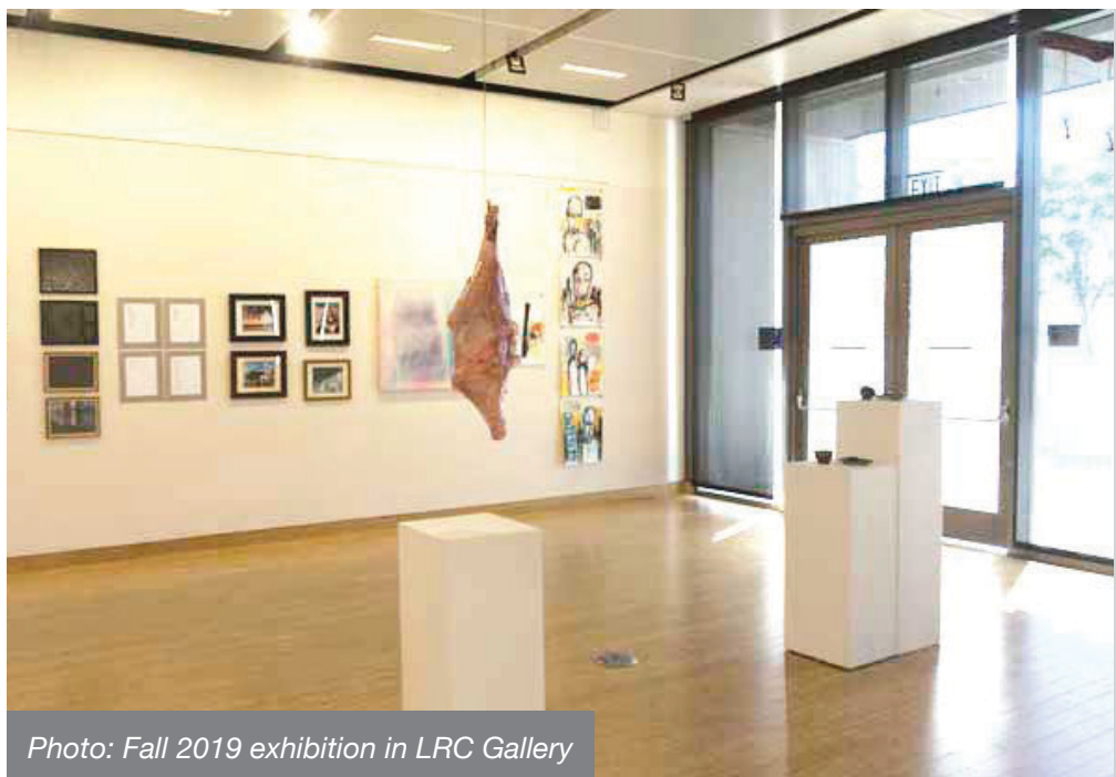
Photo: Fall 2019 exhibition in LRC Gallery