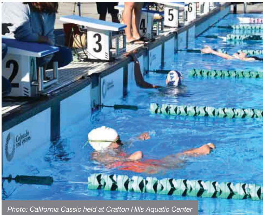
Photo: California Cassic held at Crafton Hills Aquatic Center