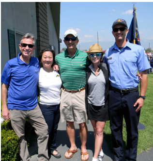
Fire Academy Golf Tournament