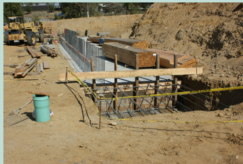
Foundation poured for one section of the OE2 Building.