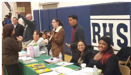
Redlands High School Career Day