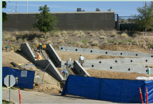
New walkway to Aquatics Center and PE Complex.