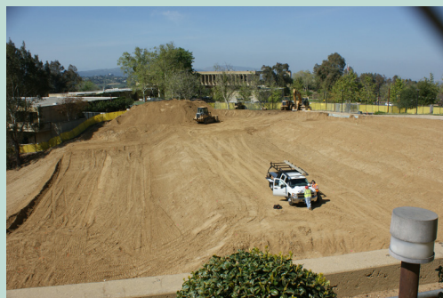
Science Building site has been graded.