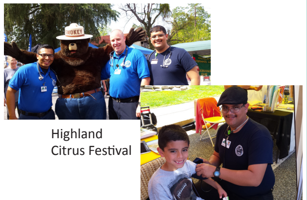
Highland Citrus Festival