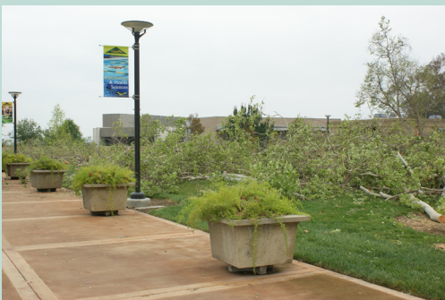
Trees cut down in Quad Area in preparation for new Crafton Center.