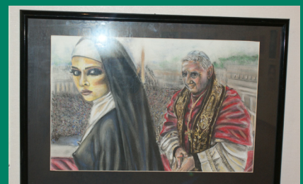
Student art was on display in the Art Gallery from December 11-19.