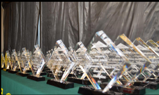
Awards to be presented

This highly successful event celebrated its 10th year on May 3. The evening was created to allow individual disciplines at the College to recognize student excellence within the discipline. Over 50 students were honored by the discipline faculty and the 154 people in attendance were treated to an Italian dinner provided by Napoli's Italian Restaurant in a delightful ambiance created by the Student Senate. A wonderful time was had by all.