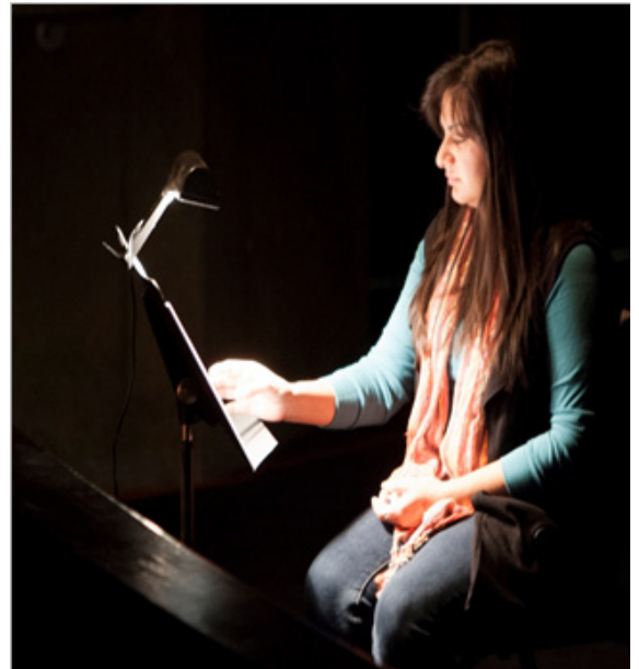
Photo of student actress in “Diversity in the Inland Empire,” Nov. 9-10, 2012.

“The Dream Act” at Crafton Hills College is one of 16 projects funded through the Community Stories grant for 2013-2014. The play will be performed at Crafton Hills College during the Fall 2014 semester and then go to Los Angeles Community College and the Odyssey Theater in Los Angeles.