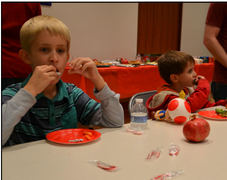
It's a family affair