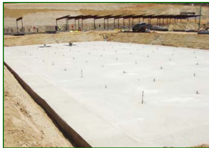
Pool & Recreation Center