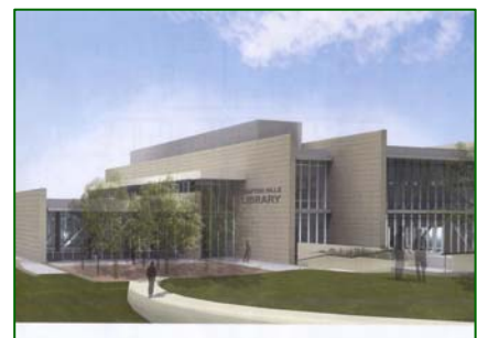
Rendering -- LRC Library