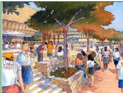
Rendering -- Living Wall