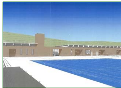
Rendering -- Pool & Recreation Center